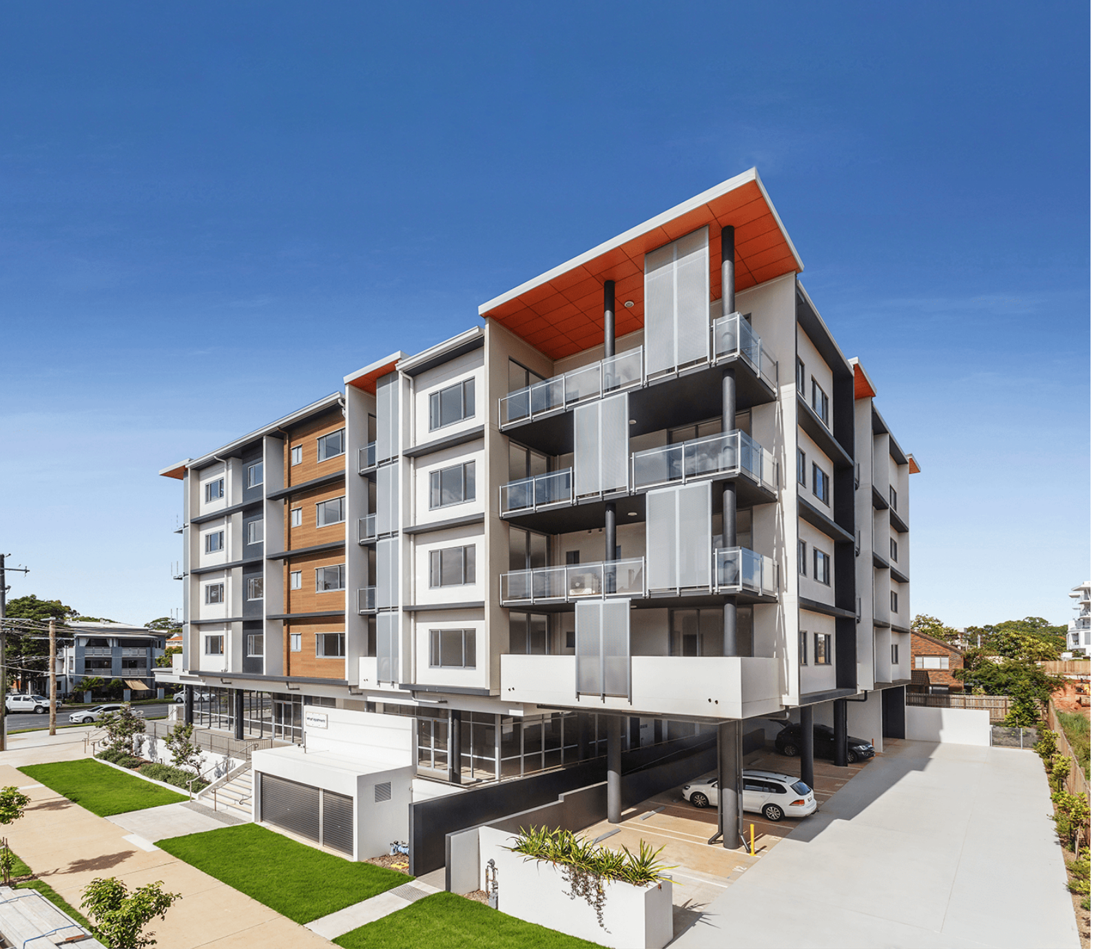
Pictured: Wharf Street, Cleveland | Project completed while Lead Architect at AAD

Registered architects and certified LHA assessors