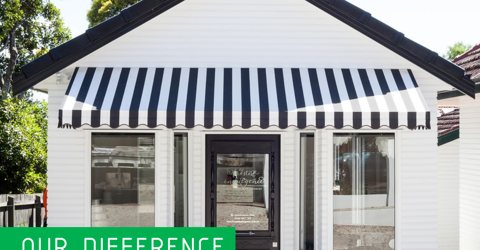
Pictured: Commercial kitchen and cake studio, Holland Park