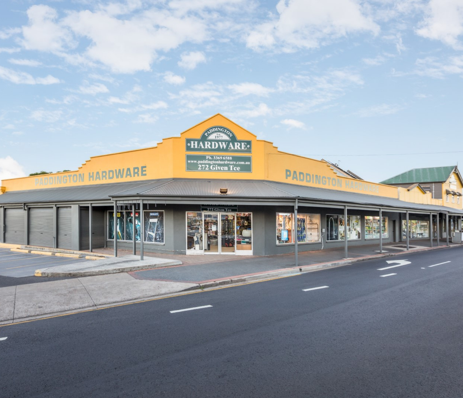
Pictured: Paddington Hardware | Project completed while Managing Architect at AAD

We deliver innovative, sustainable and considered commercial facilities