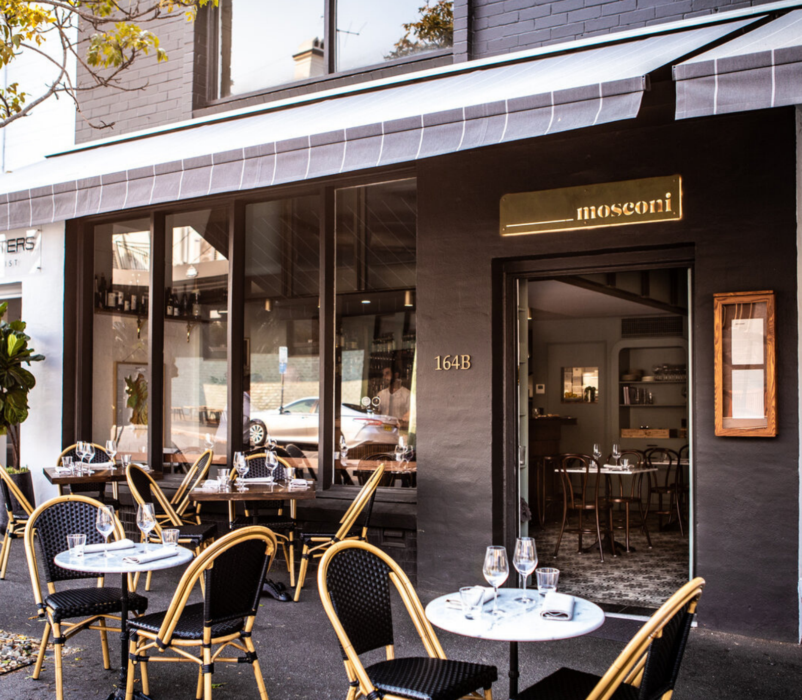
Pictured: Mosconi Restaurant, Arthur Street New Farm

We'll help ensure the successful delivery of your project