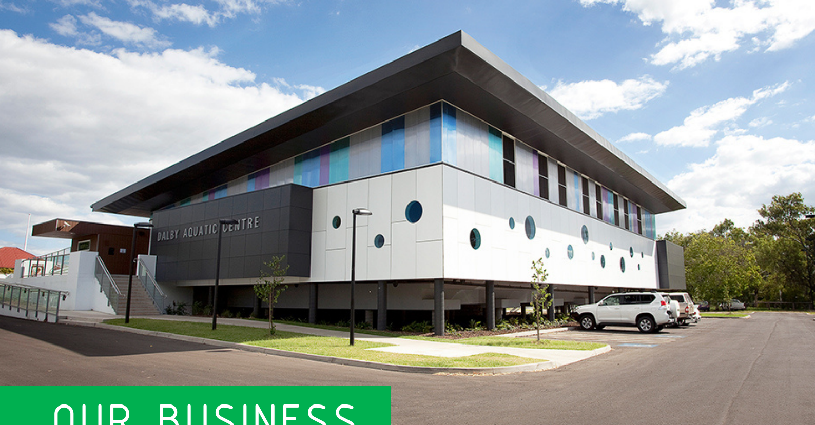
Pictured: Dalby Aquatic Centre | Project completed while Liquid Blu