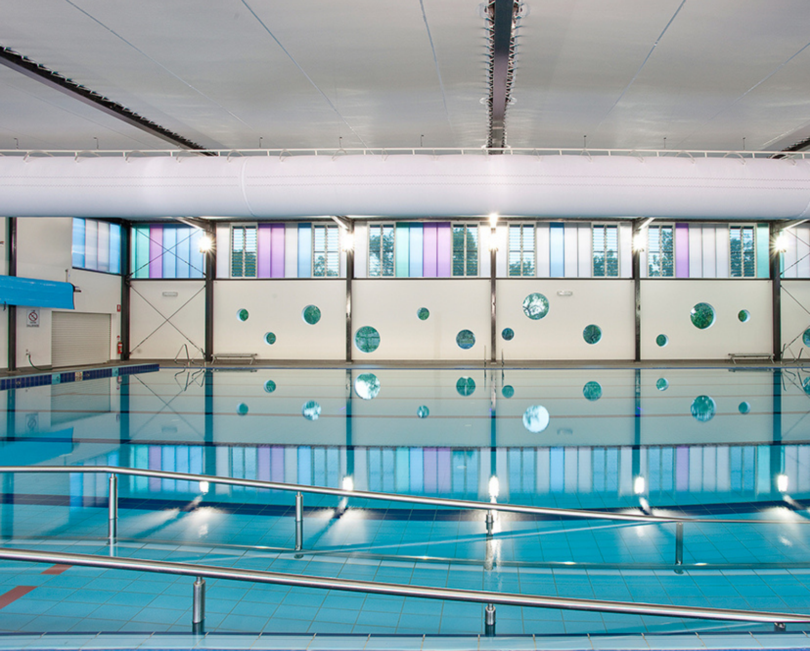
Pictured: Dalby Aquatic Centre | Project completed while at Liquid Blu